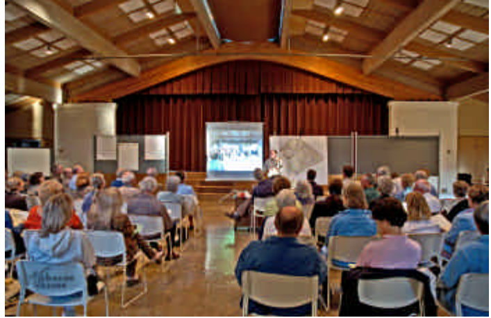
Over 180 residents worked to layout eight site plan alternatives that formed the basis for design alternatives.

Begin Environmental Review Process. All projects that could have a potential environmental impact are required to go through an "Initial Study" to determine if the project will have potential significant impacts on the environment. The Town will be initiating this process in early 2005.