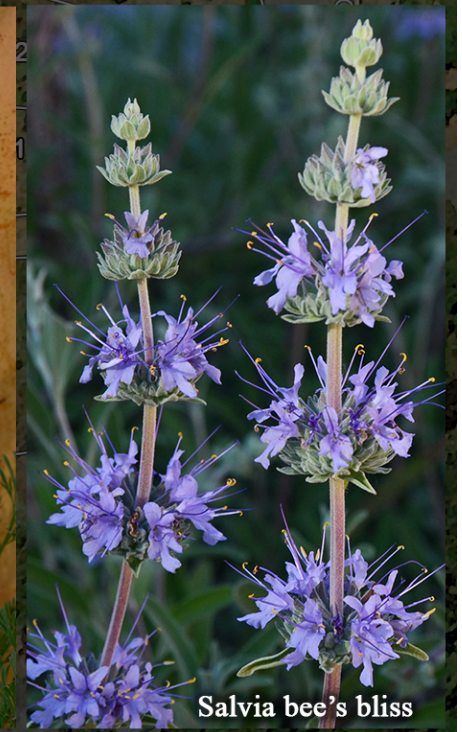
Salvia bee's bliss