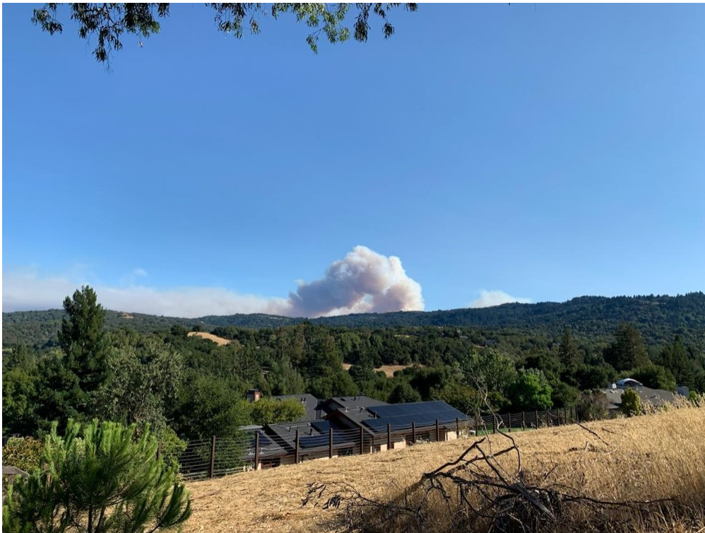
(CZU Complex fire, Aug 20, 2021, burning 3 miles from the intersection of Alpine and Portola Road.

Sincerely Yours Ron Eastman Portola Valley