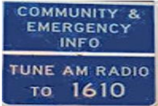
Figure 5 Standalone TIS Sign