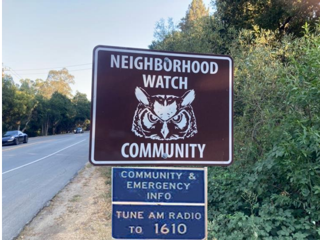
Figure 3 TIS sign as a “rider” to existing Neighborhood Watch Sign