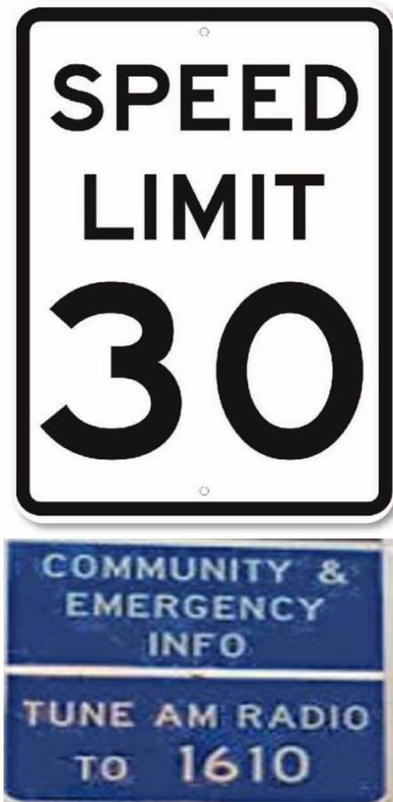
Figure 4 TIS Sign as “rider” to existing speed limit sign