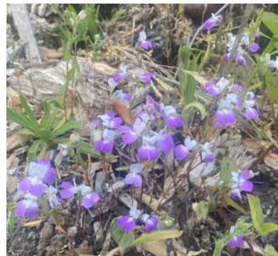
Purple Chinese houses, Collinsia heterophylla