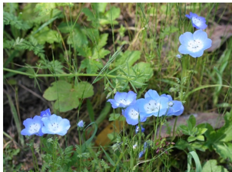
Baby Blue Eyes, Nemophila menziesii

Below find photos of just a few of our local native wildflowers that are available by seed.