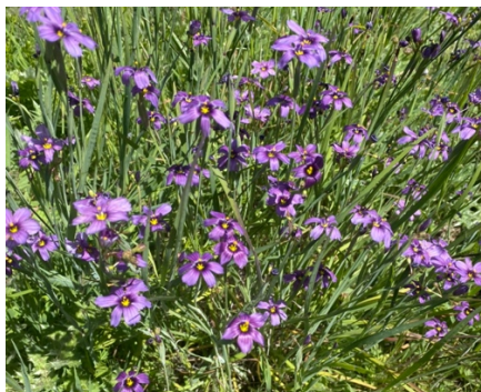
Blue-eyed grass, Sisyrinchium bellum