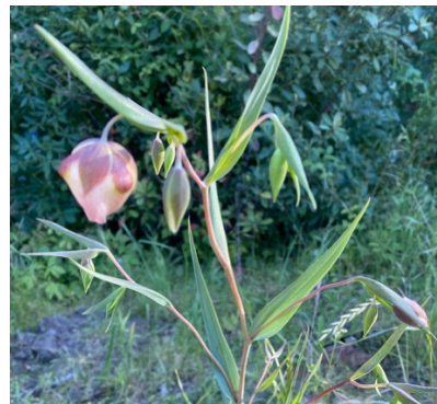
Globe lily, Calochortus albus