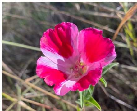
Farewell-to-Spring, Clarkia amoena